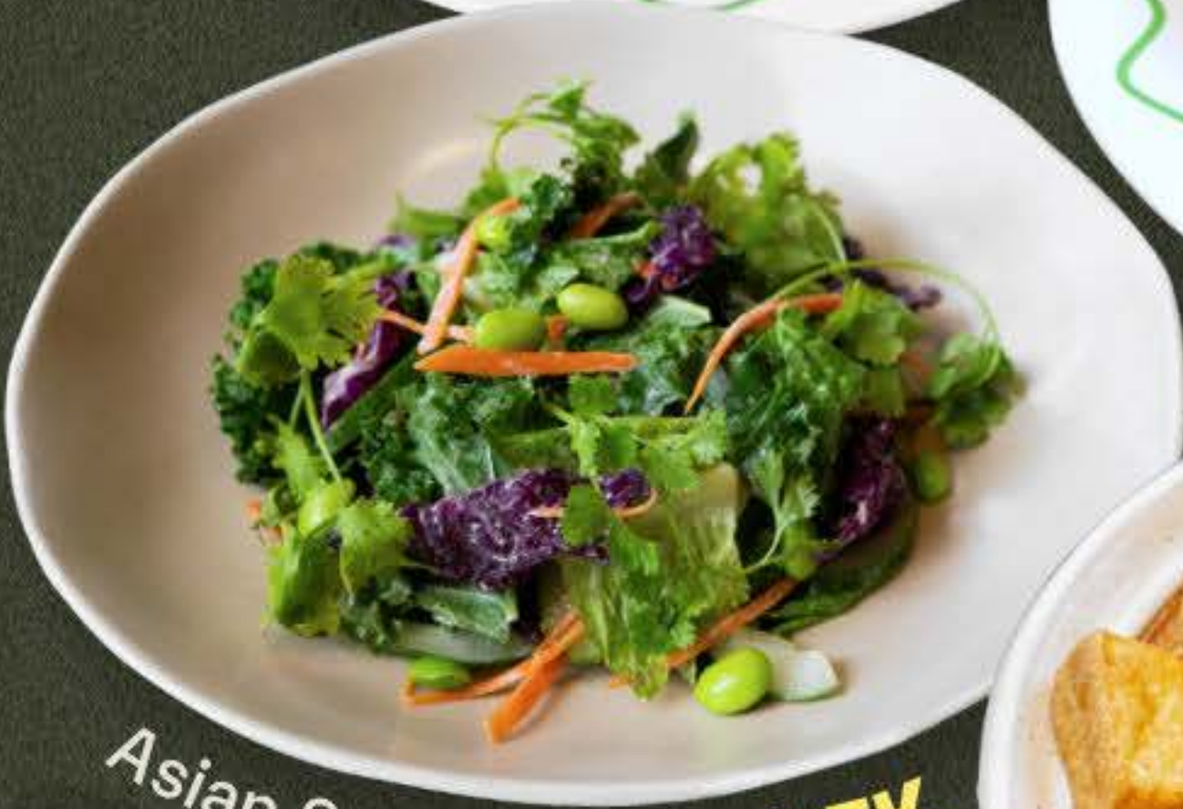
Asian Sesame Salad 45K