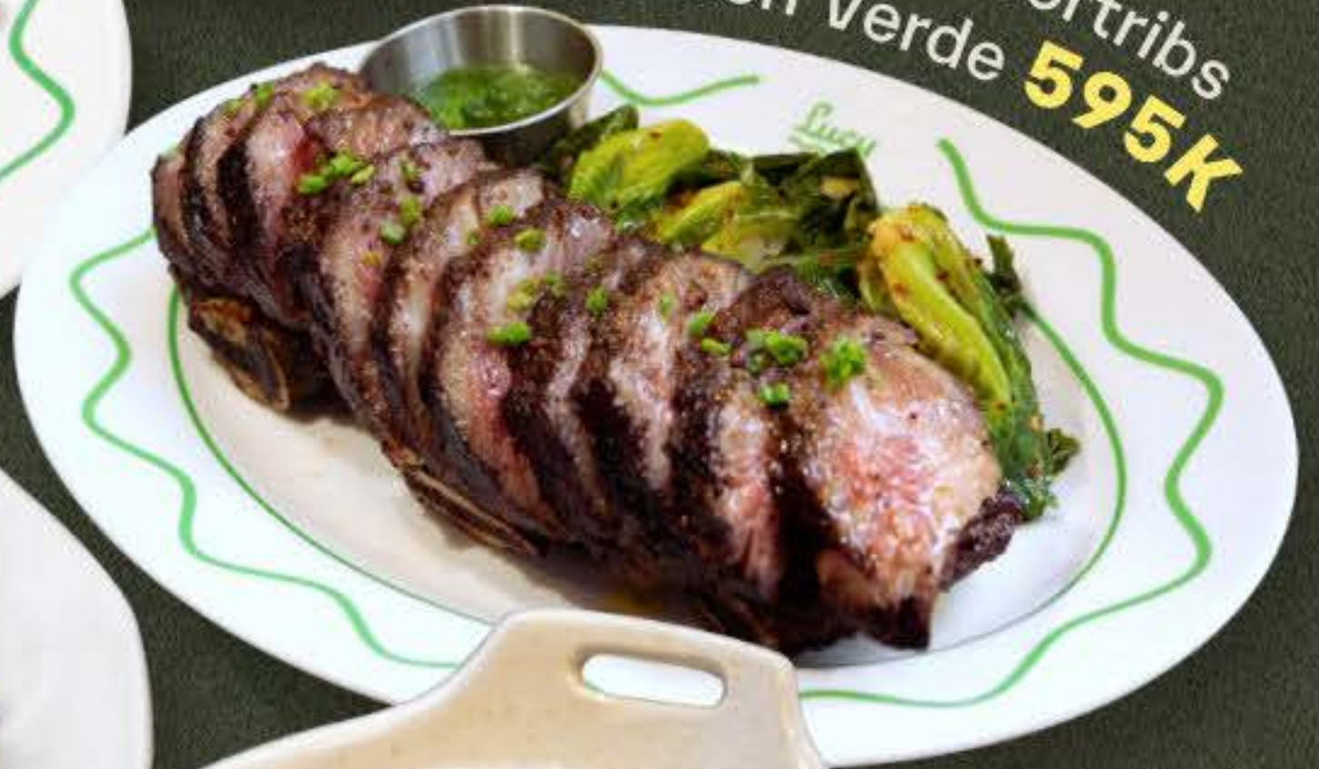
Charred Shortribs Green Verde 595K