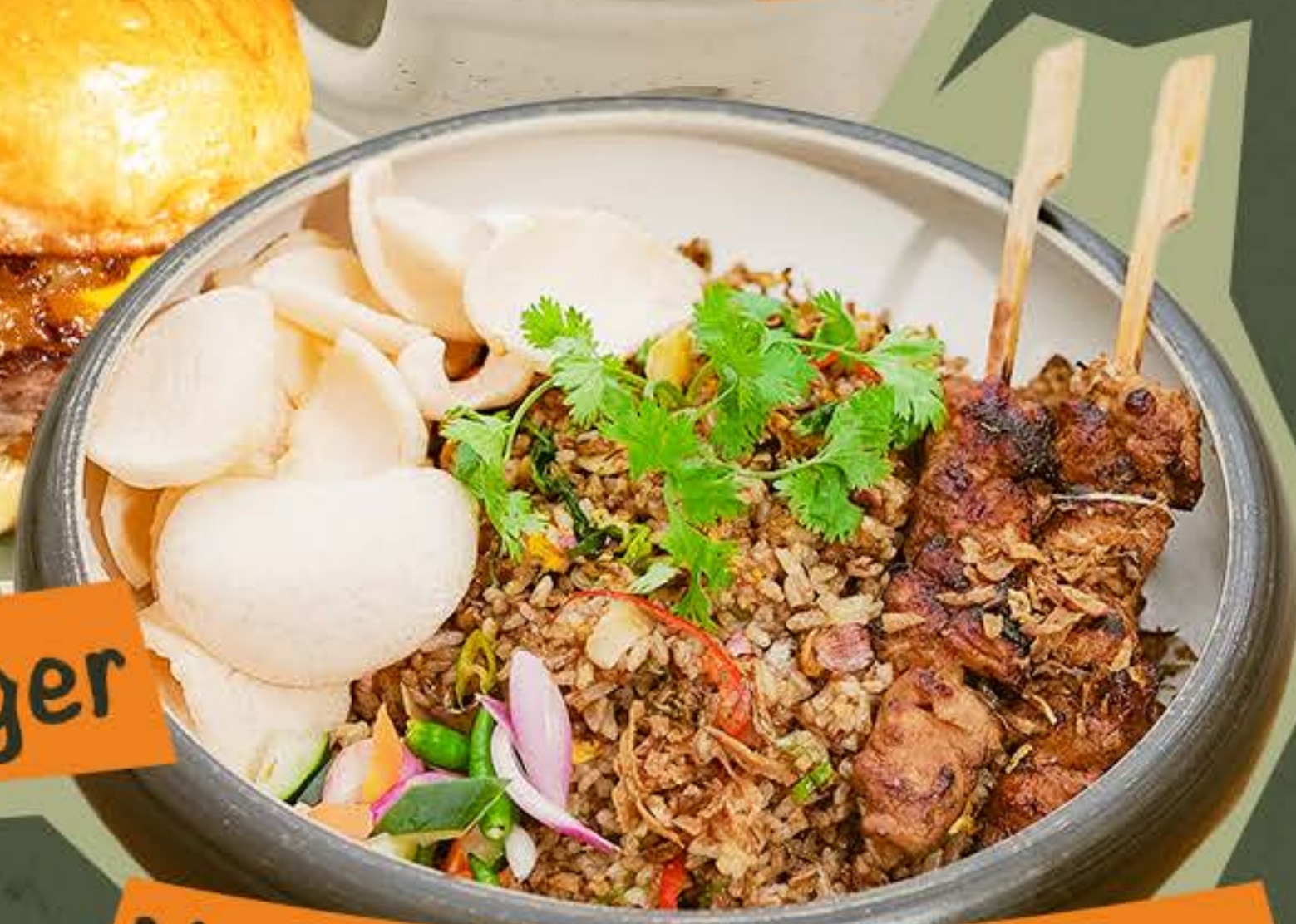
Nasi Goreng Cakalang