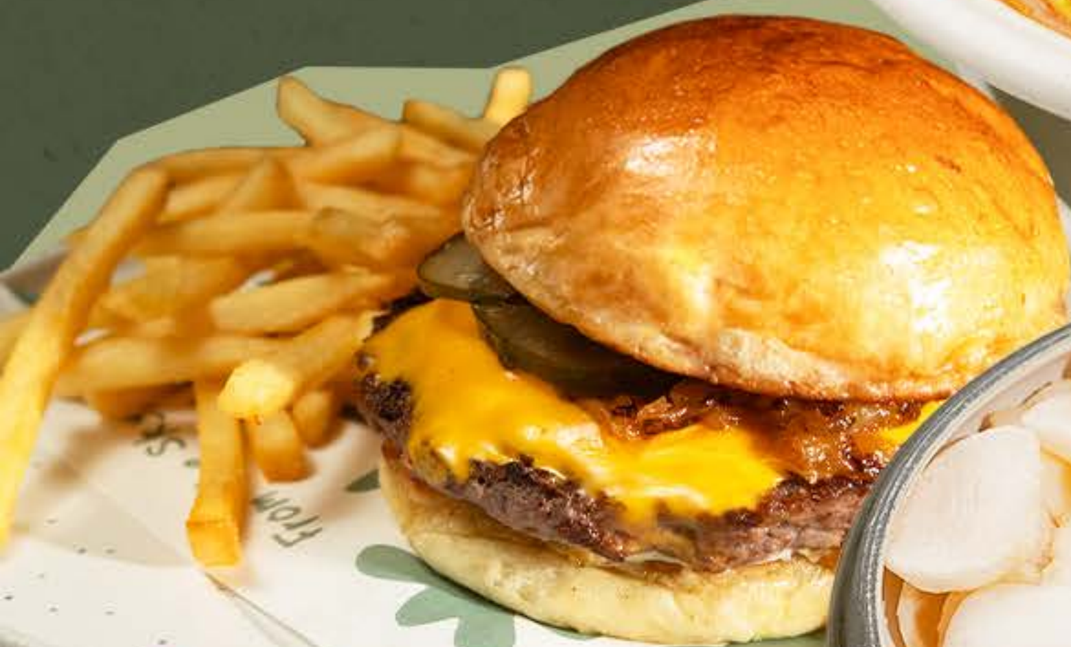
Lucy Beef Burger